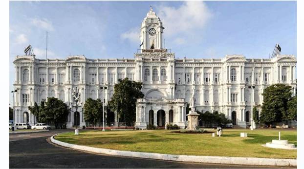
Fort St. George

Fort St. George - Govt. Museum - Valluvar Kottam - Snake Park - Temple and Marina Beach.