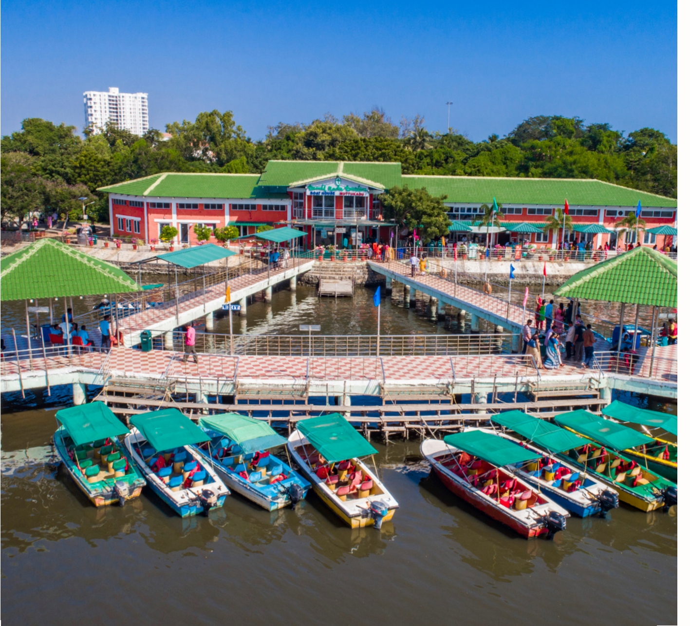
● Muttukadu Boat House