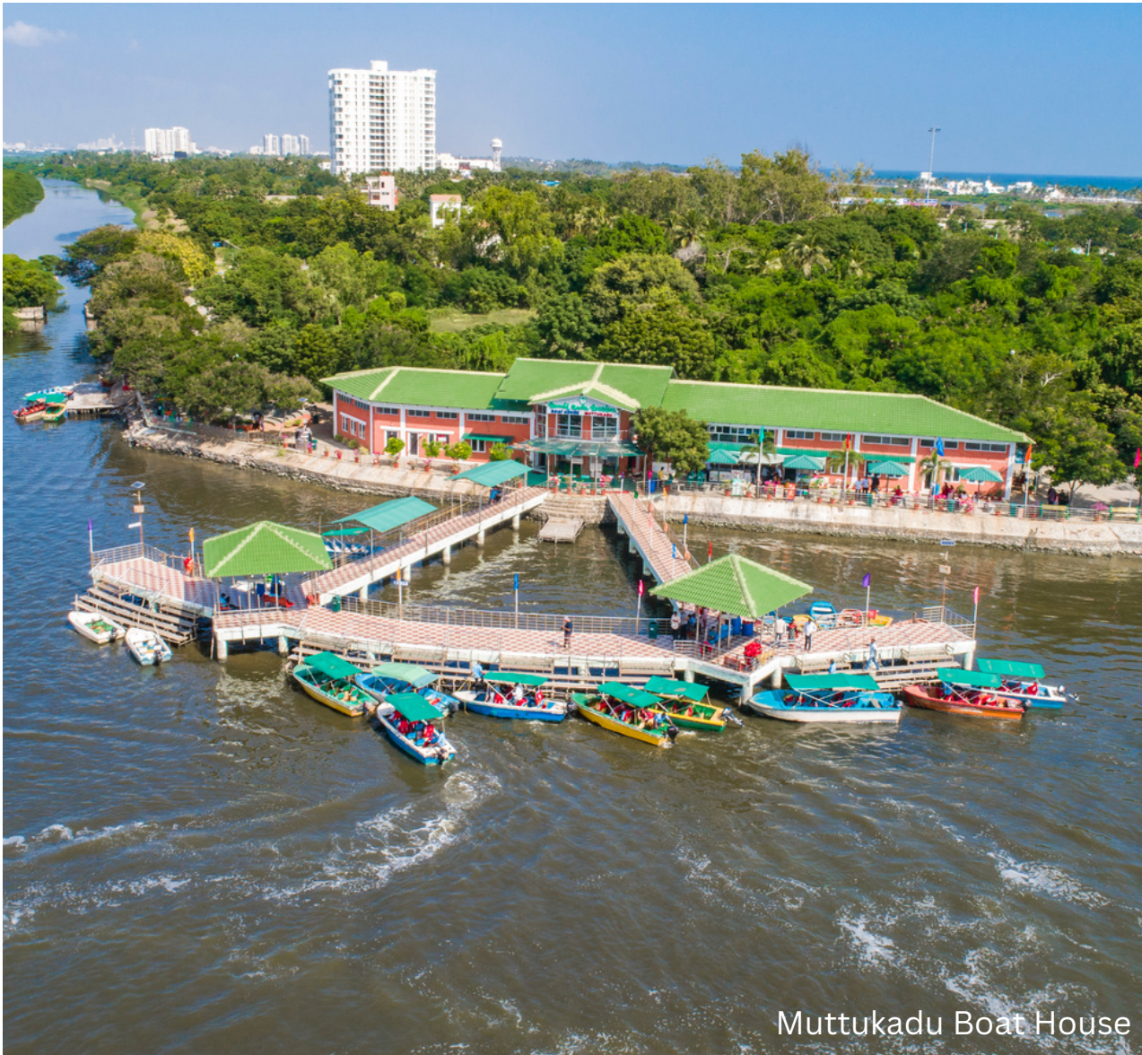
Muttukadu Boat House